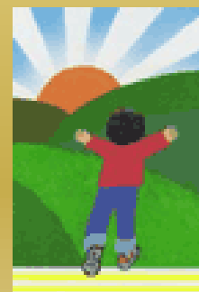
Better Beginnings, Better Futures