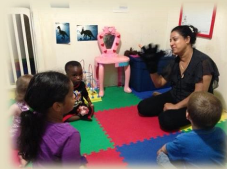
Circle Time Activity