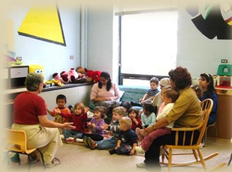
At the Library