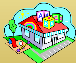
Community Health Centres