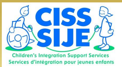
Supported School Readiness Program with the Ottawa Catholic School Board