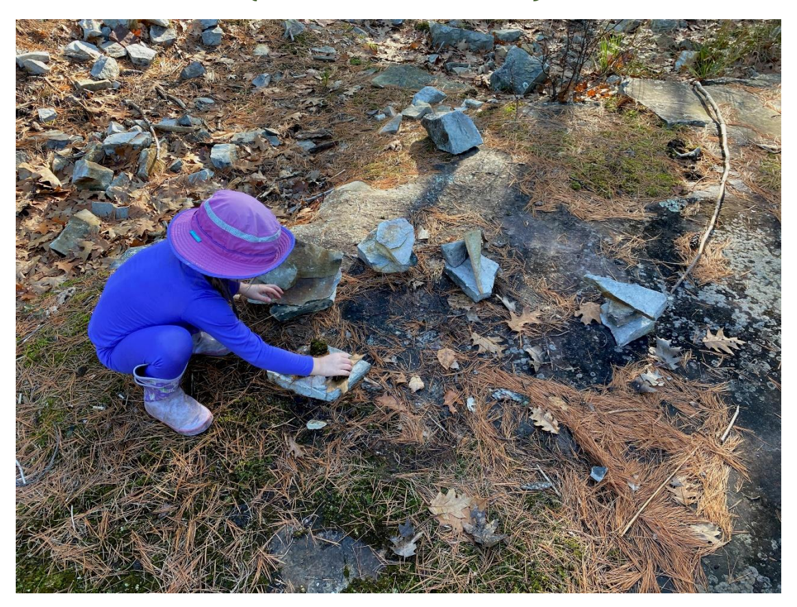
With grateful acknowledgement to Child and Nature Alliance Canada (CNAC) for their generosity, commitment and belief that all children benefit from spending time in the forest.